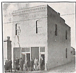
BANK BUILDING 1021 West Salem Avenue

This sub-division is a beautiful landscape, laid out in lots, streets, avenues and alleys;