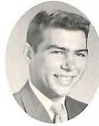
Swanson Angle 90