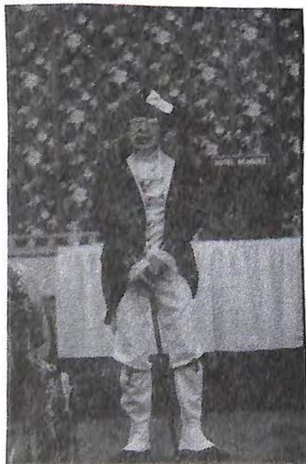
"Continental Line Soldier"

"Have you been to the 'arch-ives' in Washington City?"