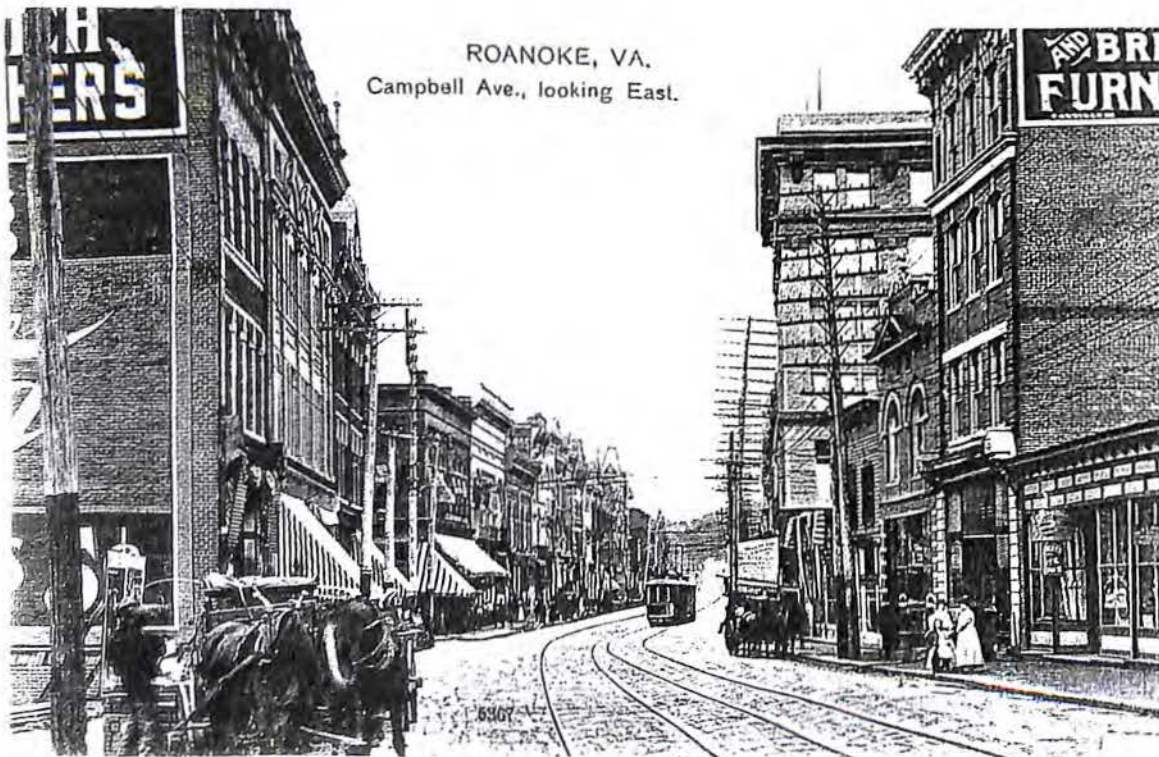
ROANOKE, VA. Campbell Ave., looking East.