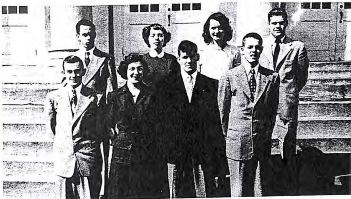
BEDFORD HIGH SCHOOL SENIOR CLASS, 1952